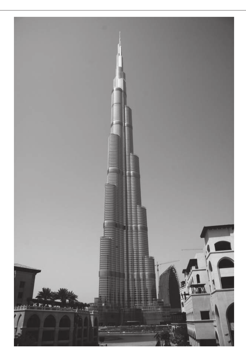
Fig. 1 for Question 1

The Burj Khalifa is a skyscraper in Dubai. It is the tallest structure in the world standing at over 800 metres. The Burj Khalifa is a recognised tourist attraction which has: